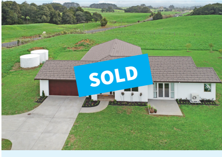
3 Sands Road, Waiuku Congratulations - SOLD!