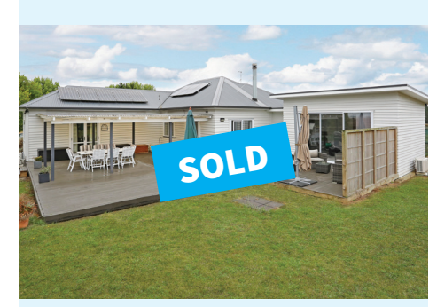
152 Otuiti Road, Pukekawa Marketed & sold by Jo-Ann

238 Punga Punga Road, Pukekawa Priced $600,000