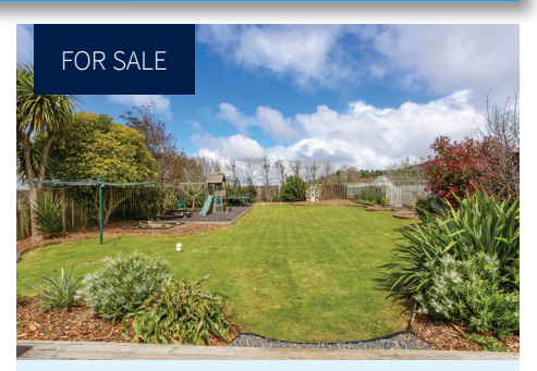
60 Parsons Road, Onewhero Priced $550,000